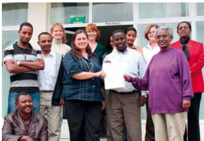
Midwifery College staff

Our midwives belong to us and we shall be responsible for them once they are sent out in pairs to work in the regional