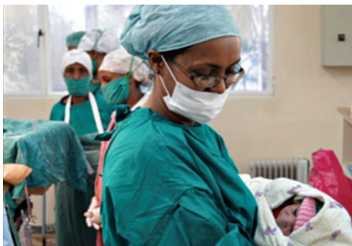
Tender care of theatre staff